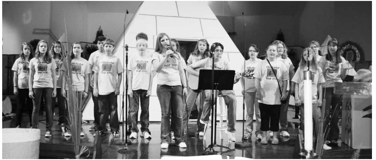
The Uth Kwior performs in worship after their 2010 Summer Choir Tour